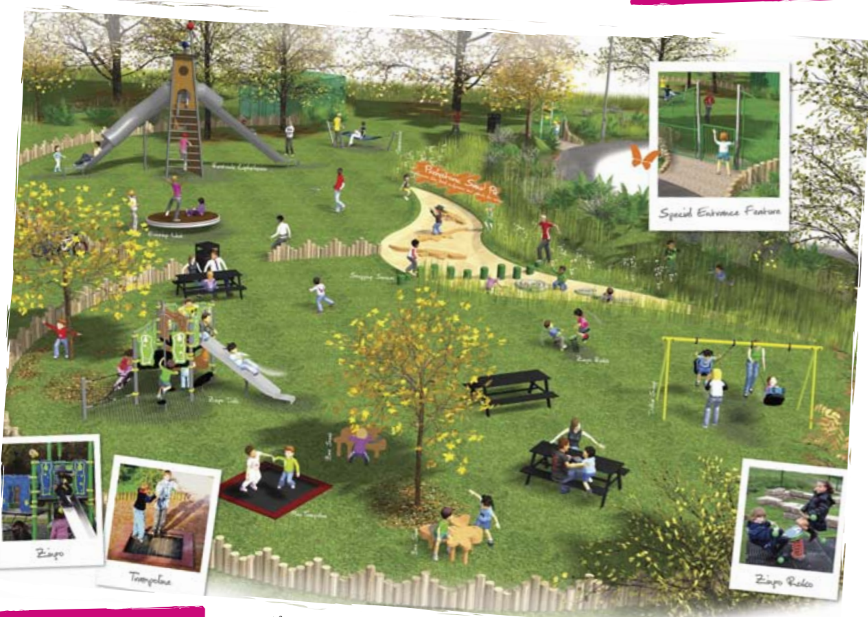
Scheme Value Circa £90K