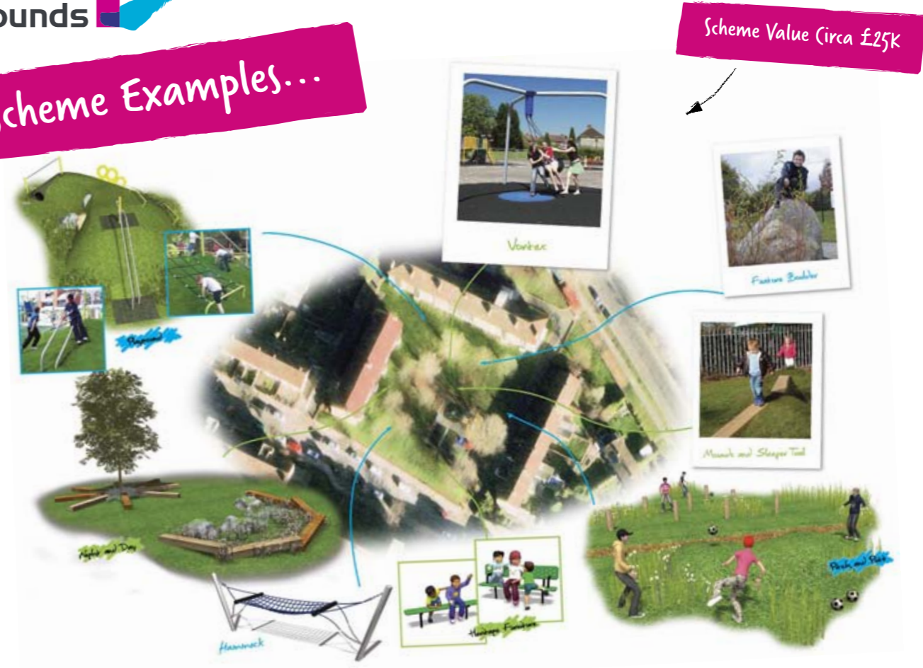
Scheme Value Circa £25K