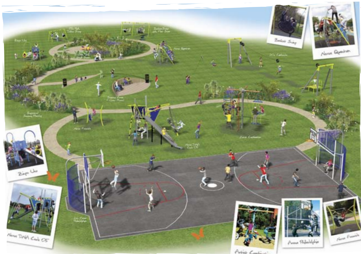
Scheme Value Circa £85K

Scheme values correct at time of printing and based on real sites and landscape features.