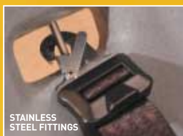
STAINLESS STEEL FITTINGS